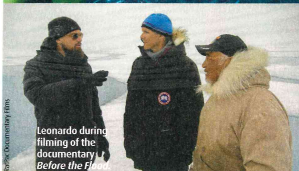
Leonardo during filming of the documentary Before the Flood .