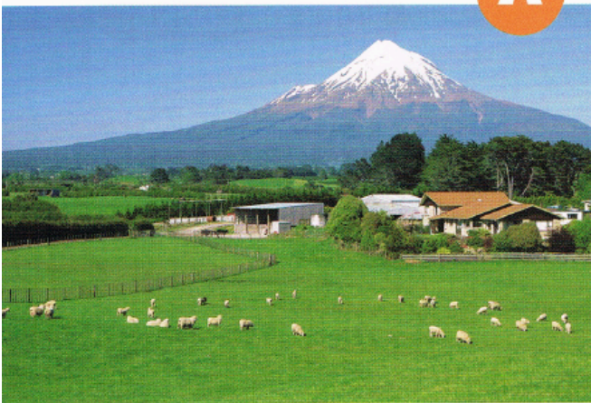
Mount Egmont in New Zealand