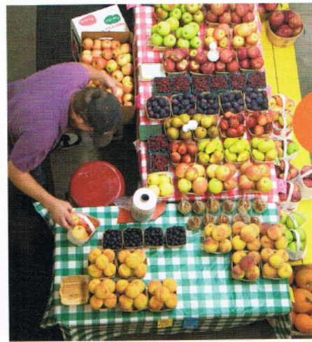
A farmers' market in England